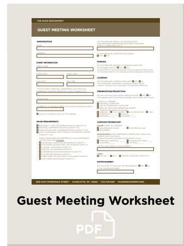
Guest Meeting Worksheet

Equipment is reserved on a first-come, first-served basis. If an event requires technology that is not available in-house, the event host will be responsible for making arrangements with The Duke Endowment’s required vendor and for covering the costs for equipment, set-up and labor. For specific capabilities, see room details. Pre-event technology meetings are required. Please call the Events Manager at 704.969.2147 for an appointment.